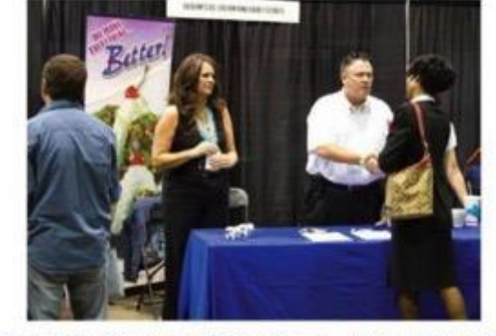
Braum's Ice Cream and Dairy Stores – "Great Turnout!" "The turnout was great! We hired at least three managers and several regular crew members for our stores in Grand Prairie, Irving, Arlington and Fort Worth. We were really impressed with how many applicantions we received!"