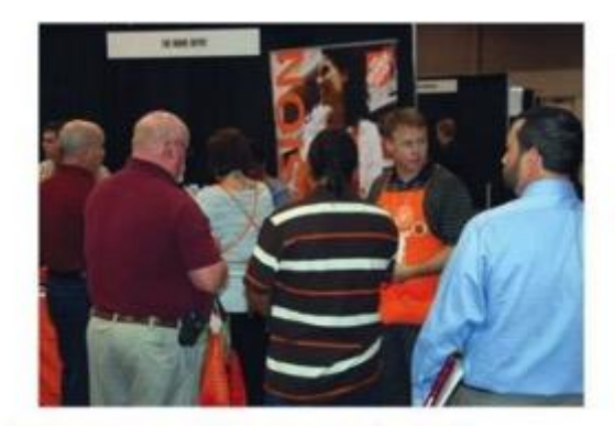
The Home Depot – "Busy and Productive!" "We enjoyed this event! It was very busy and productive. We were visited by at least 300 potential candidates over the seven hour period. It was fairly intense! There was always a line and we spoke to candidates in rapid succession with very few lulls along the way."