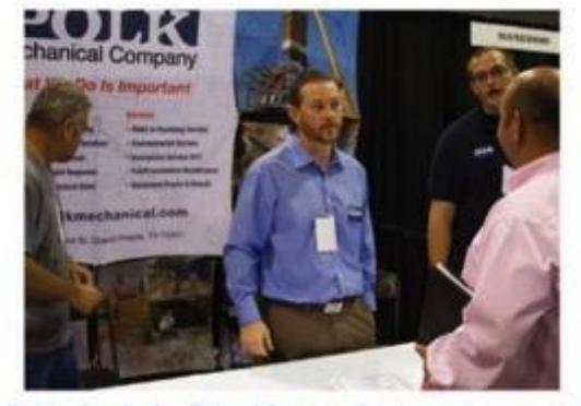
Polk Mechanical – "Hired four tradesmen, six trainees!" "What we like best was the steady flow of people all day long. Although there were a lot of people, it never felt cramped or crowded. We hired four skilled tradesmen and six trainees from applications received the day of the event."